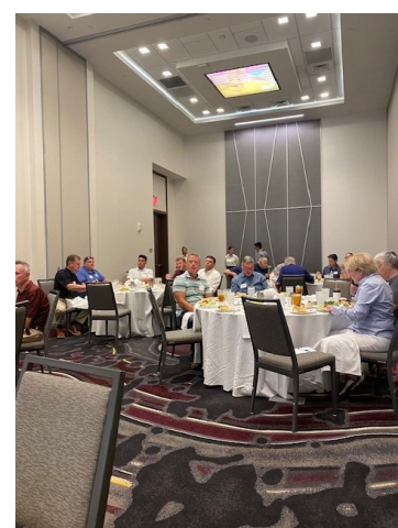
3rd Q Chapter Meeting