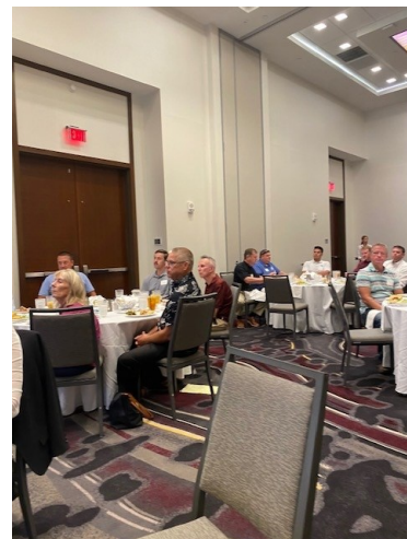
Lunch meeting and seminar