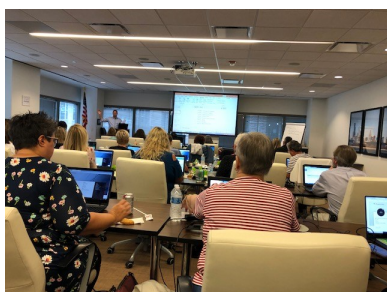
NetForum Training with Chapter Executive Directors at National Office in Chicago