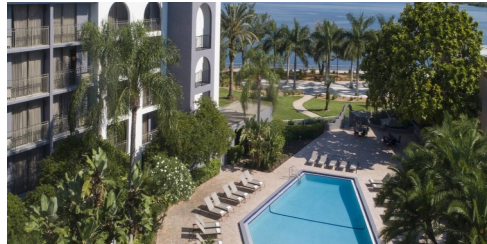
Courtyard Marriott Riverfront

Note—(Sleeping rooms available for $149/night until 10-18-19, mention "Appraisal Institute" group rate)