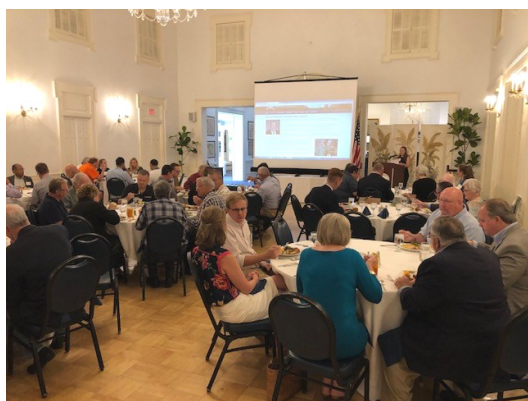
3rd Quarter Chapter Meeting at Tampa Yacht Club