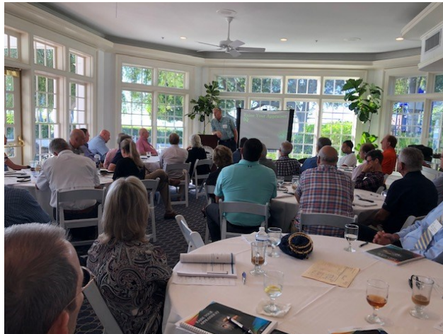
August seminar at Tampa Yacht Club