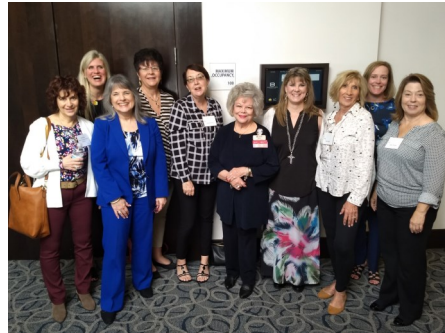
Region and chapter executive directors representing ten AI chapters attending joint region meeting in Orlando FL