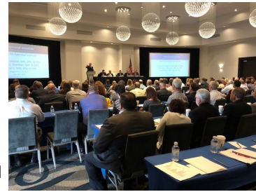
Joint Regional Meeting, Orlando

The first Region X event took place on February 8 th and 9 th . Region X hosted and participated in a Joint Region Meeting that was held at the B Resort in Orlando. The Friday agenda included an excellent inspirational opening speaker and five mini-LDAC sessions. There were 109 attendees on Friday, and the mini LDAC sessions included topics such as Rolling Out the Welcome Mat to new members, The Best Way to deliver education, How Should We Lead in the industry, how to Focus on Client Needs, and Do We Really Police our members to maintain a higher standard. The Saturday agenda included a morning of National AI updates, and the individual Region Meeting sessions were then held over lunch and into the afternoon.