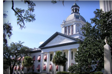
Florida State Capital

Where: Four Points Sheraton Downtown 316 W. Tennessee Street, Tallahassee www.fourpointstallahasseedowntown.com