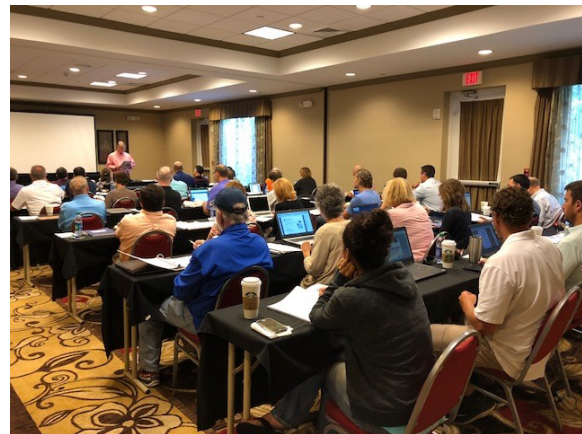
USPAP class in Ft. Myers in April