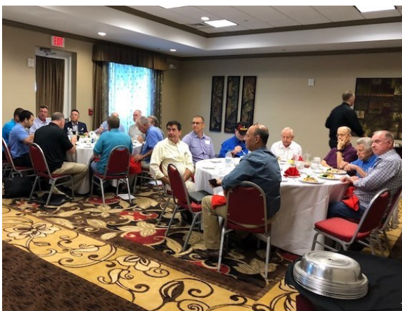
Attendees at the 2nd Quarter Meeting