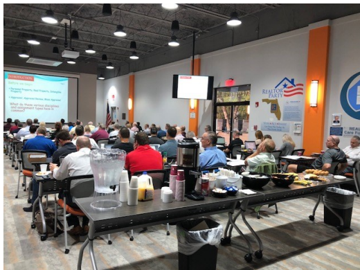
Florida Law seminar at Tampa Realtors