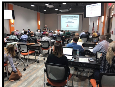
USPAP class held in Tampa

these specific classes, enter the promo code CHAPTER , and you will automatically receive the special FGC chapter member discount price. You will, however, still need to purchase the 2018-2019 USPAP Book directly from the Appraisal Foundation.