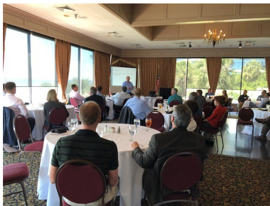
2nd Q Meeting and Seminar—Tampa