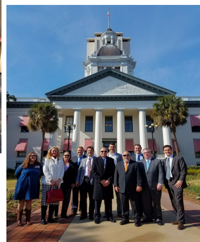
2018 VALUEvent with Region X Representatives at the State Capital