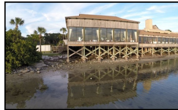
Rusty Pelican, Tampa

All Events: Lunch + Meeting + Seminar = $105 | $120