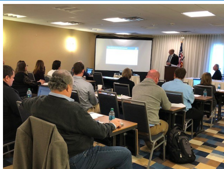
Region X Meeting—Tallahassee