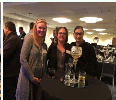
1st Q Meeting and Region X Reception