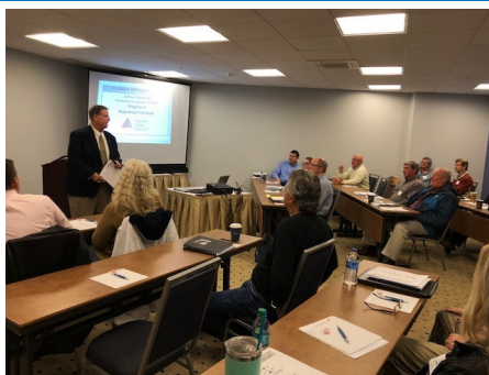
Florida Law seminar in Tallahassee